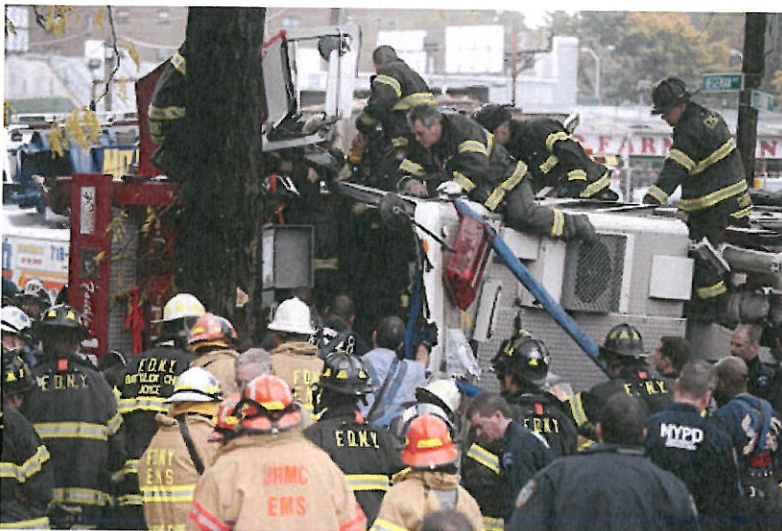
FEVELO FOR NEWS